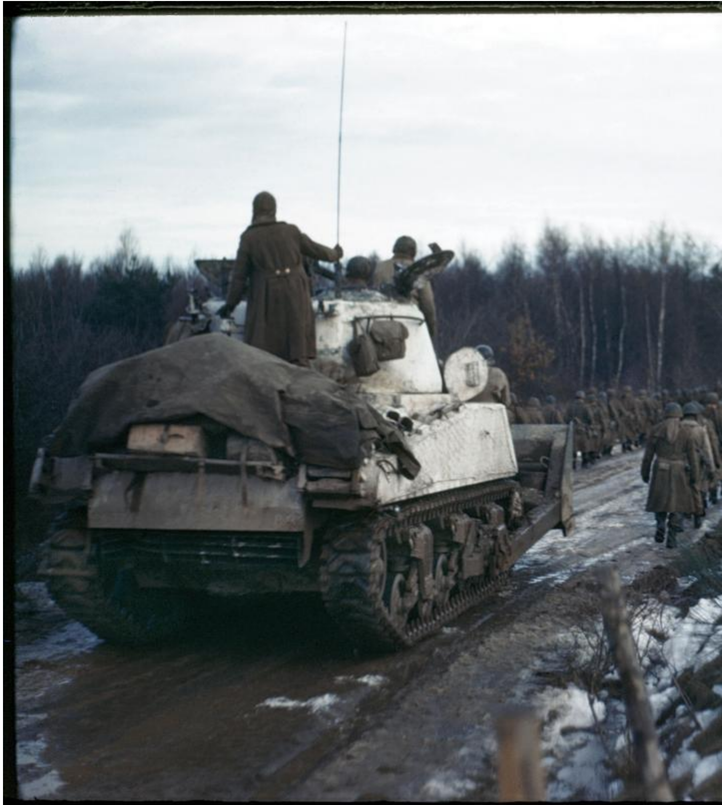
Trier, Germany, 1944. Americans advance through the Hurtgen Forest before the start of the Battle of the Bulge.