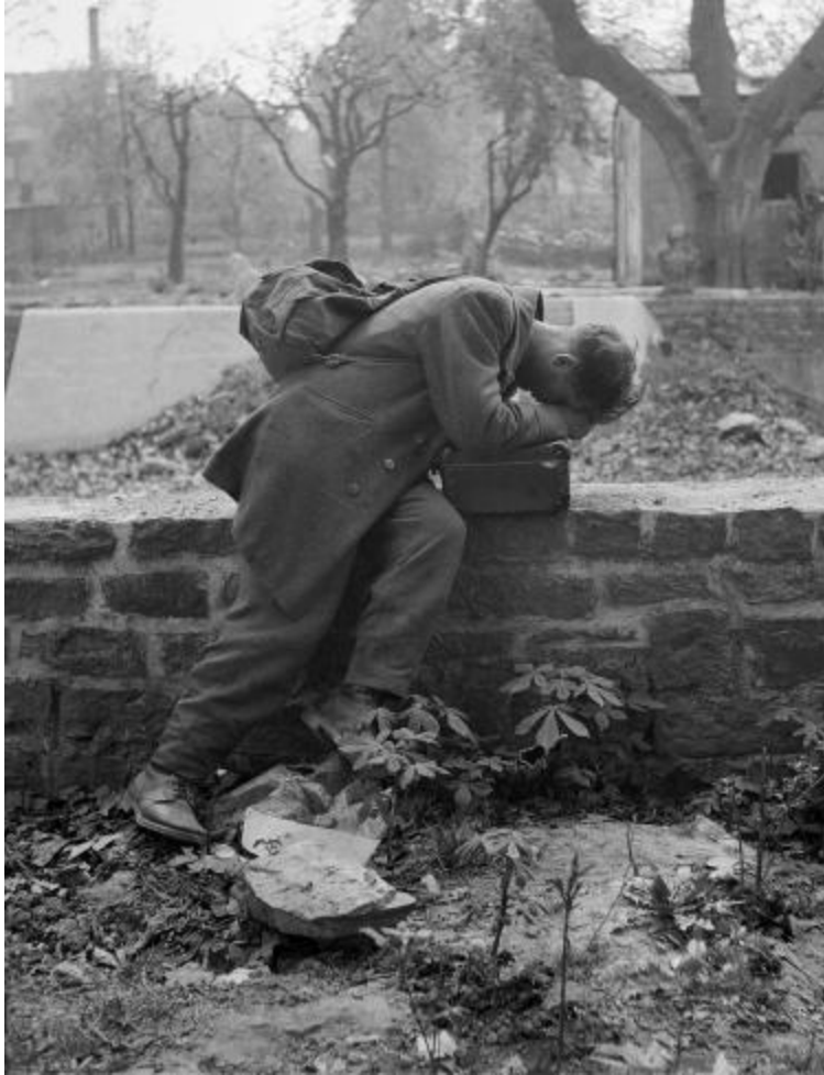
Frankfurt, Germany, 1947. A

defeated German soldier, held prisoner in the U.S., returns to his home only to find a pile of rubble.